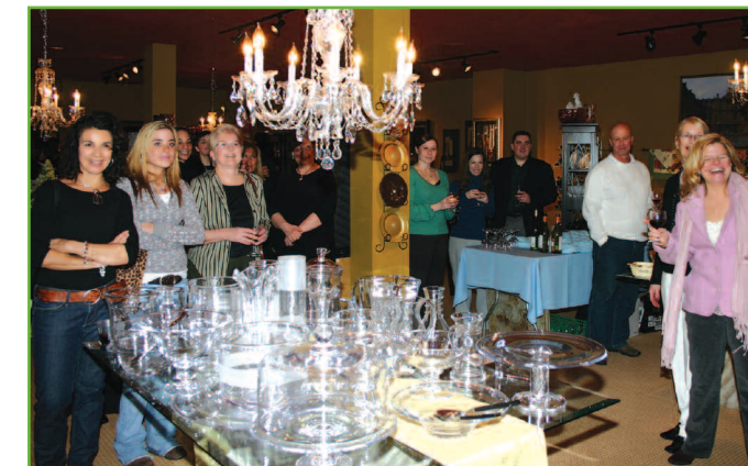
Attendees enjoying the evening!!